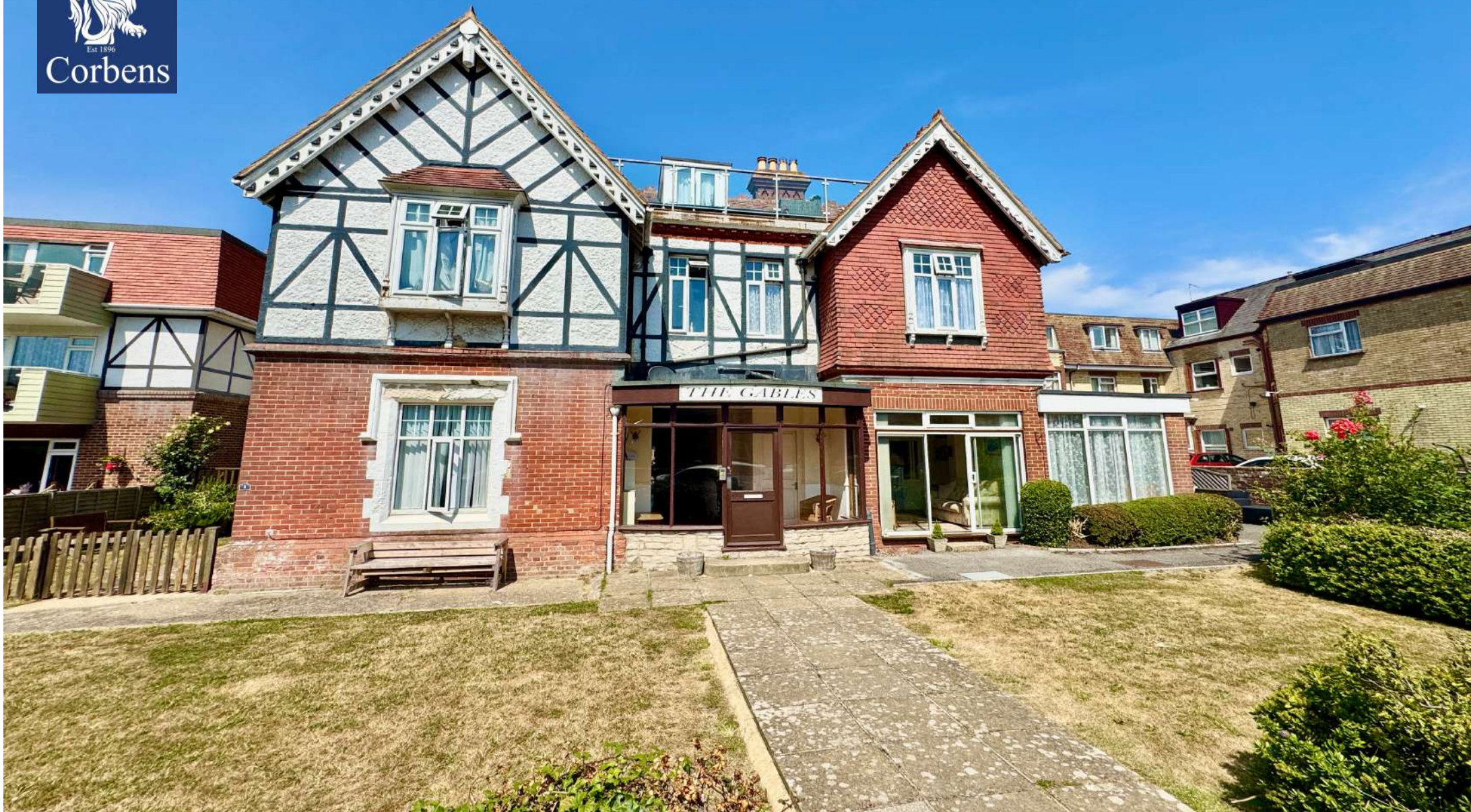
FLAT 3 THE GABLES VICTORIA AVENUE, SWANAGE £199,500 LEASEHOLD