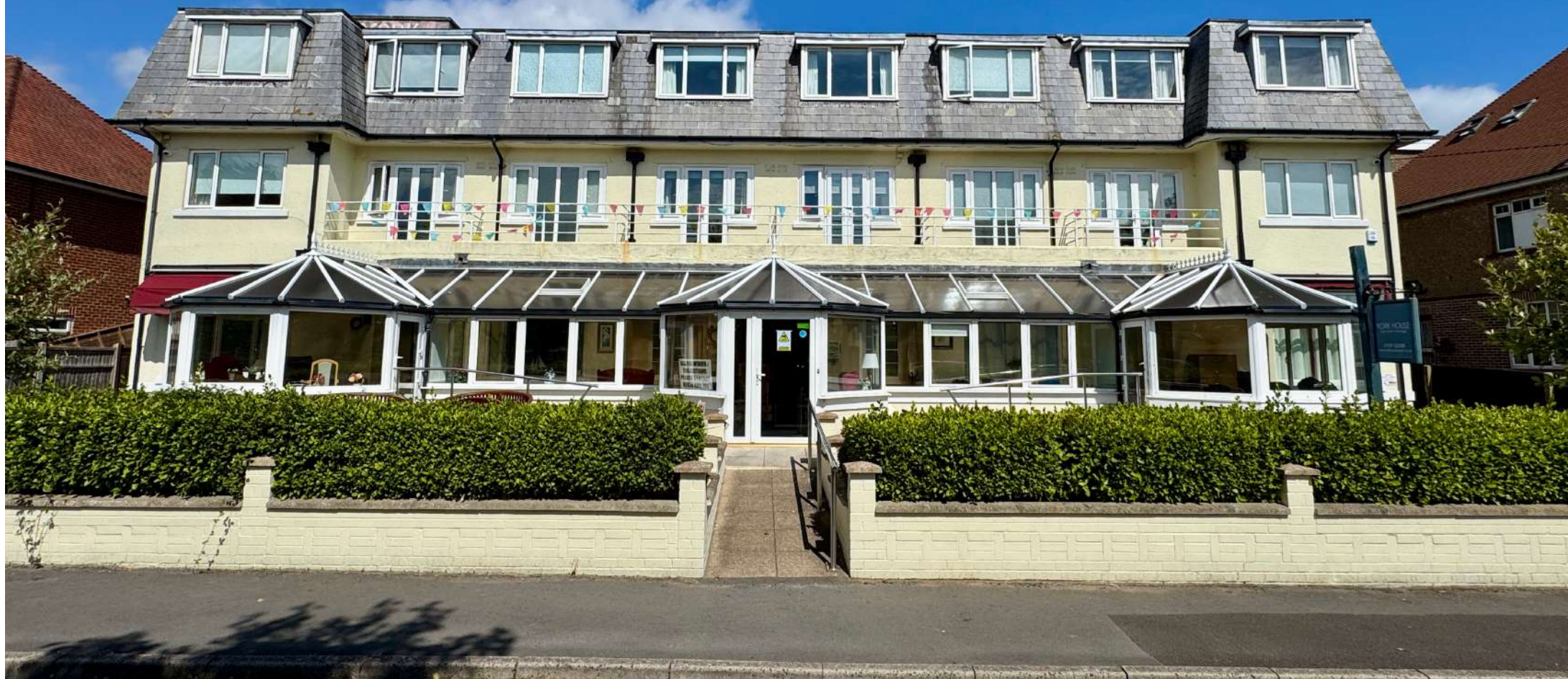
YORK HOUSE, CAULDON AVENUE, SWANAGE Guide £2,000,000 Freehold