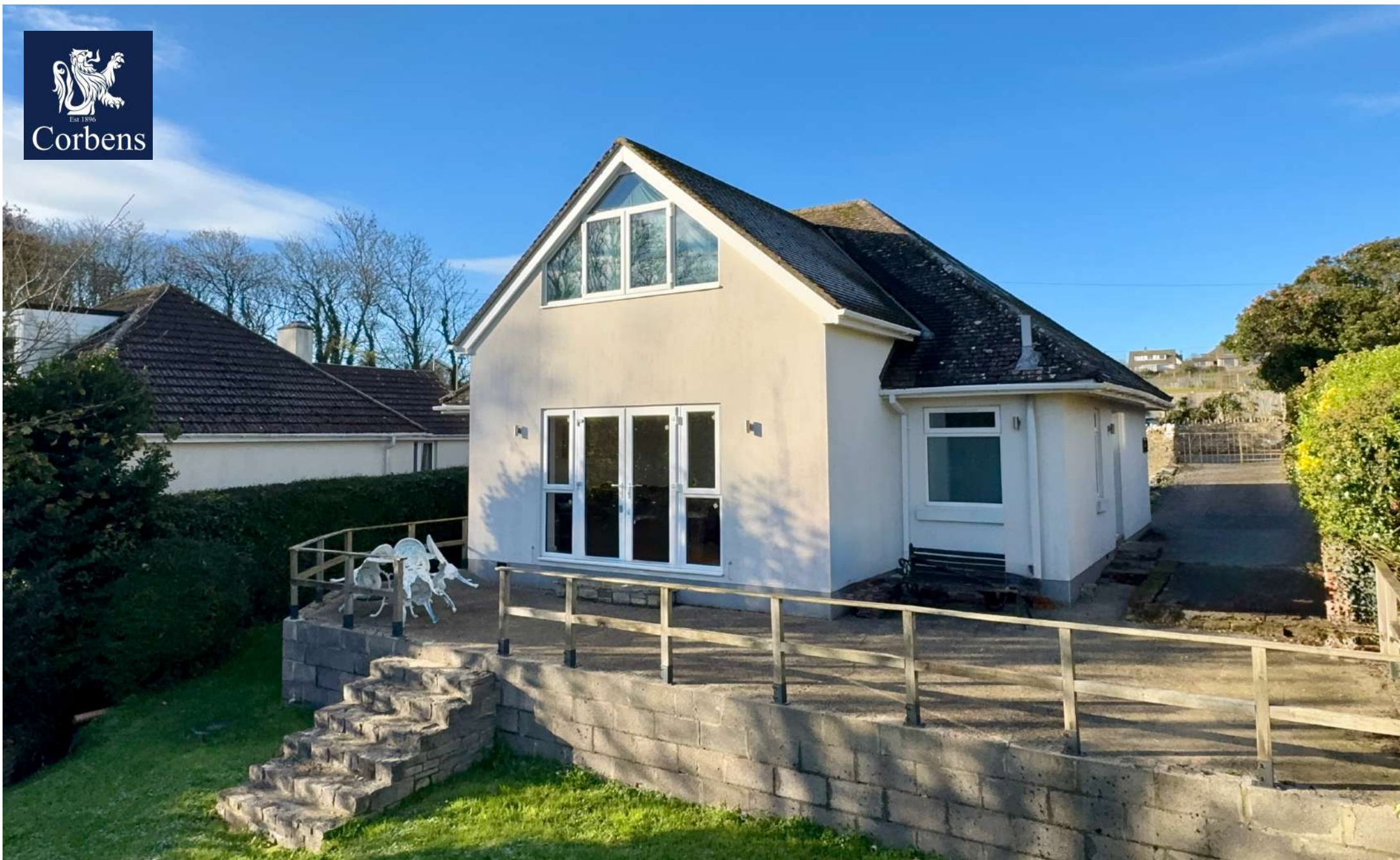
SPYWAY COTTAGE, DURNFORD DROVE, LANGTON MATRAVERS £595,000 FREEHOLD