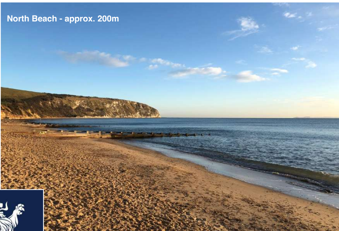
North Beach - approx. 200m