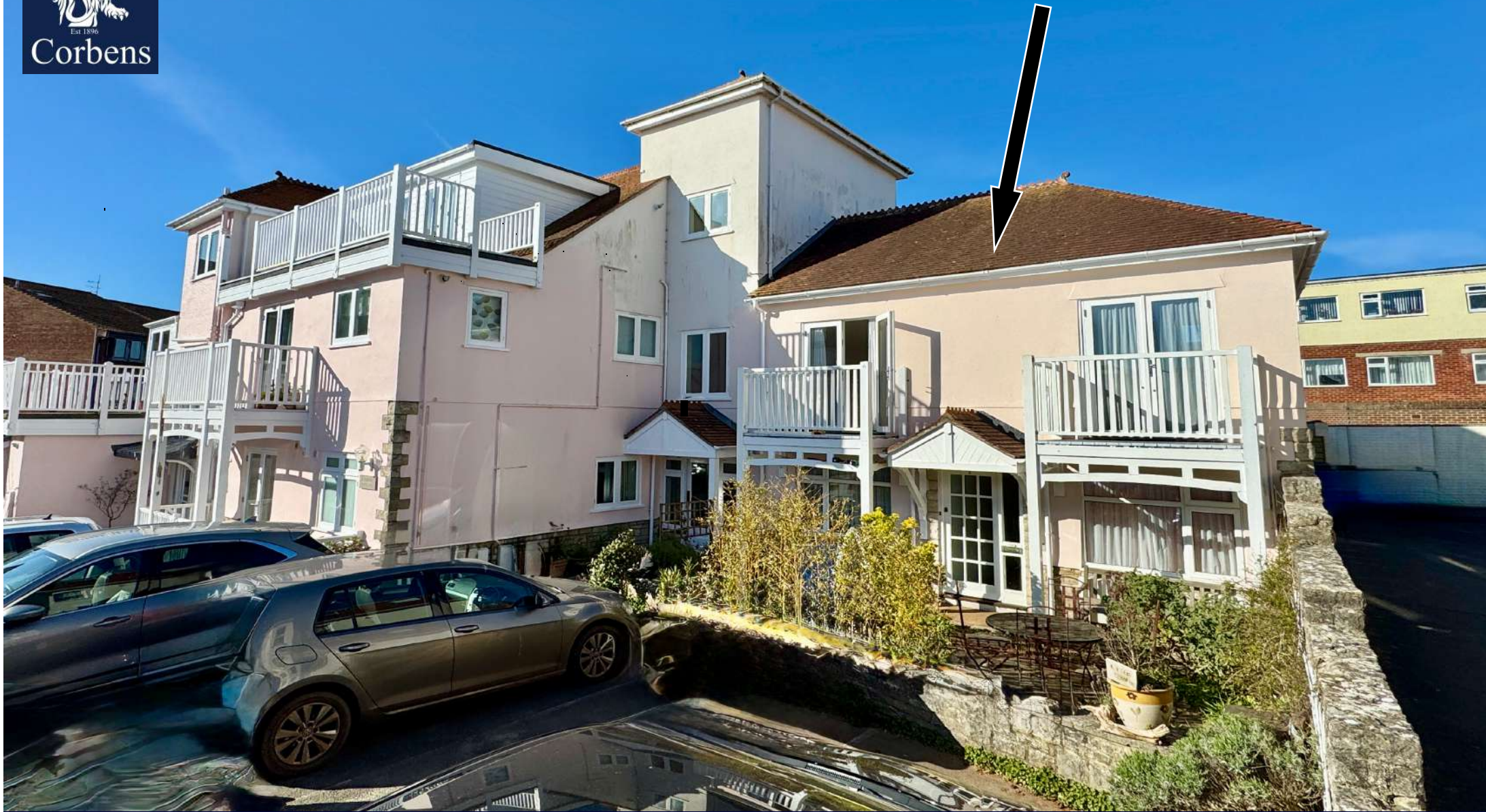
3 SEASHELLS, 7 BURLINGTON ROAD, SWANAGE £265,000 Leasehold