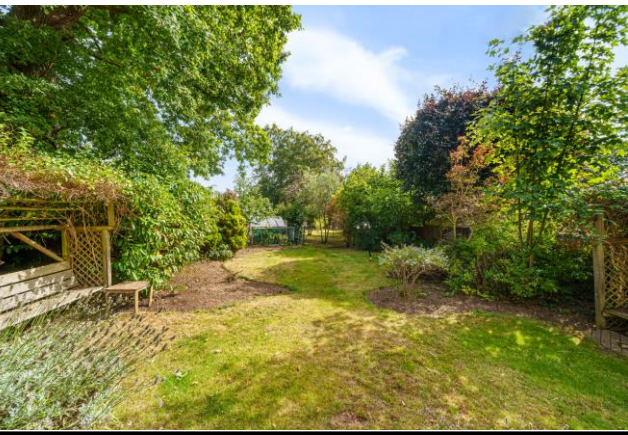
WOODHAM GUIDE PRICE £1,000,000

Introducing this charming fivebedroom detached family residence, a hidden gem on the market for the first time since built.